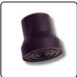
10121 Rubber foot for reel