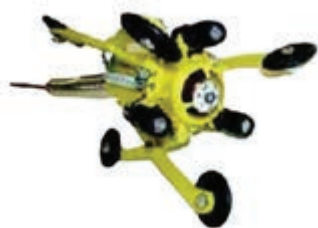
SK-RSL Universal roller skid for 1.68" or 1.43" camera head for 6" - 14" pipes