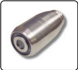
CH-123SL 1.23" self levelling camera head - stainless steel