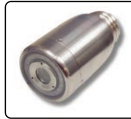
CH-168SL 1.68" self levelling camera head - stainless steel