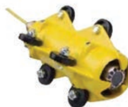
SK-RSMN Mini roller skid for 1.23" camera head for 4" - 6" pipes

PROUDLY DESIGNED AND MANUFACTURED IN NORTH AMERICA