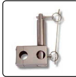
10105-H12 Mounting bracket complete with pin & shaft for large and extra large reels