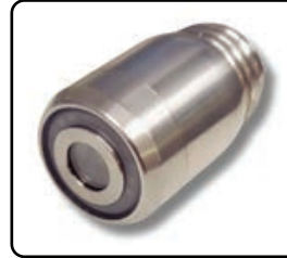
CH-143SV 1.43" straight view camera head - stainless steel