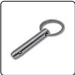
90204 Pin for reel mounting bracket