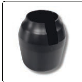
SK-123SV P-trap skid for 1.23" straight view camera head

PROUDLY DESIGNED AND MANUFACTURED IN NORTH AMERICA