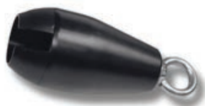
SK-123TOW Tow skid for 1.23" camera head