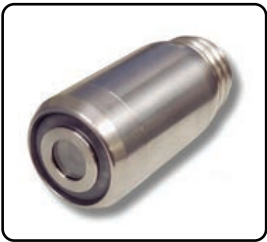
CH-143SL 1.43" self levelling camera head - stainless steel