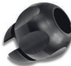
SK-1GR Grooved skid for micron 1" camera head