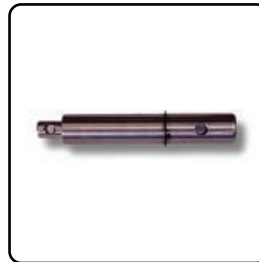
10128-H12 Shaft for controller mounting bracket