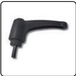
10119 Small brake handle for mini/mid reels