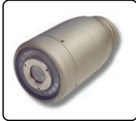
CH-168SL(AL) 1.68" straight view camera head - aluminum