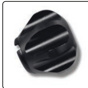
SK-143GR 3" grooved skid for 1.43" camera heads