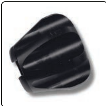
SK-168GR 3" grooved skid for 1.68" camera heads