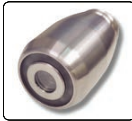
CH-123SV 1.23" straight view camera head - stainless steel