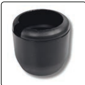
SK-143SV P-trap skid for 1.43" straight view camera head