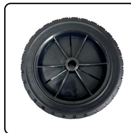
WHEEL7 7" wheel in black

PROUDLY DESIGNED AND MANUFACTURED IN NORTH AMERICA