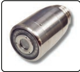
CH-168SV 1.68" straight view camera head - stainless steel