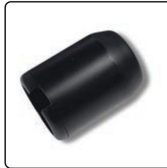
SK-143SL P-trap skid for 1.43" self leveling camera head