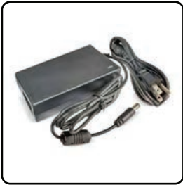
PS-12V 12V power supply

Controller mounts, power supplies, camera head skids and brake handles - Hathorn carries all the accessories you need to upgrade and maintain your camera system.