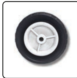
WHEEL6 6" X 1 1/2" wheel for H2 and H7