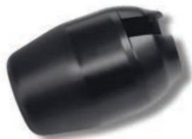
SK-1235L P-trap skid for 1.23" mini self-leveling camera head