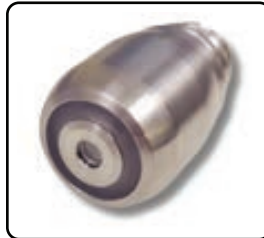
CH-1SV 1" straight view camera head - stainless steel *Please specify if Wi-Fi camera is needed